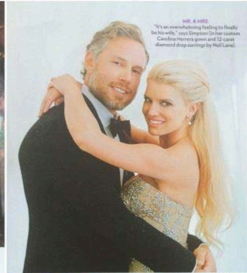
MR. & MRS. "It's an overwhelming feeling to finally be his wife," says Simpson (in her custom Carolina Herrera gown and 12-carat diamond drop earrings by Neil Lane).

Johnson was left speechless when he first saw his fashion-mogul bride in her custom Carolina Herrera champagne gown with delicate gold embroidery.